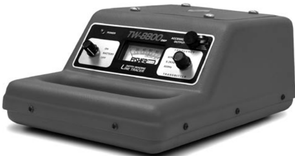
The TW-8800 Transmitter.

WARNING: Do not connect output leads to a live (energized) utility. Please prevent shock hazard and equipment damage.